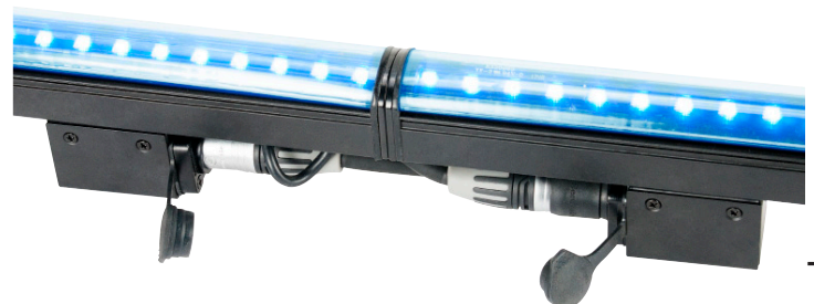
Magnetic End Caps - Seamless End-to-End Spacing

(Available in 2, 3, 5, 10, 12, 15, 20, 30, 50, meter lengths)