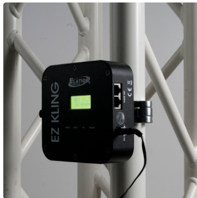
clamp shown not included

Specifications are subject to change without notice ©Elation Professional