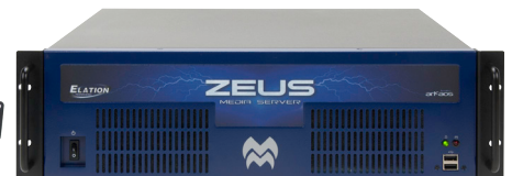
ZEUS Media Server