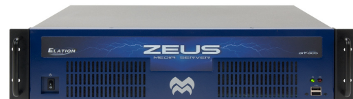
ZEUS Media Server