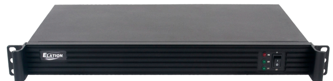
EZ6 VSC2 Media Processor

Additional Power and Data Link Cable lengths available. Contact your dealer for more information.