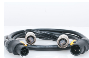
powerCON TRUE1 and etherCON CAT6 IP65 In/Out Connections