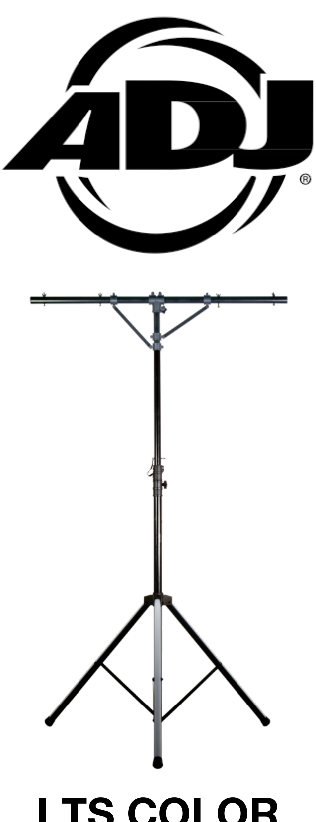
LTS COLOR user manual