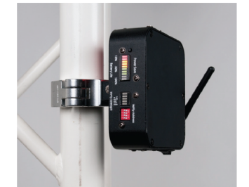
INCLUDED MOUNTING BRACKET INSTALLED ON BACK